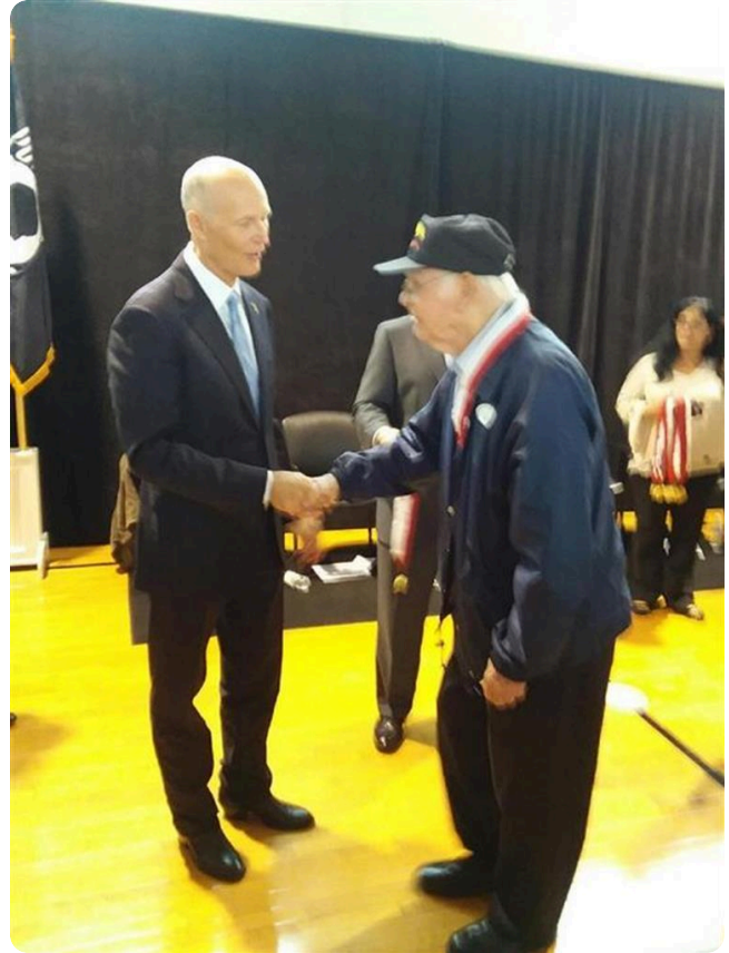
Receiving a service medal from then governor, Rick Scott